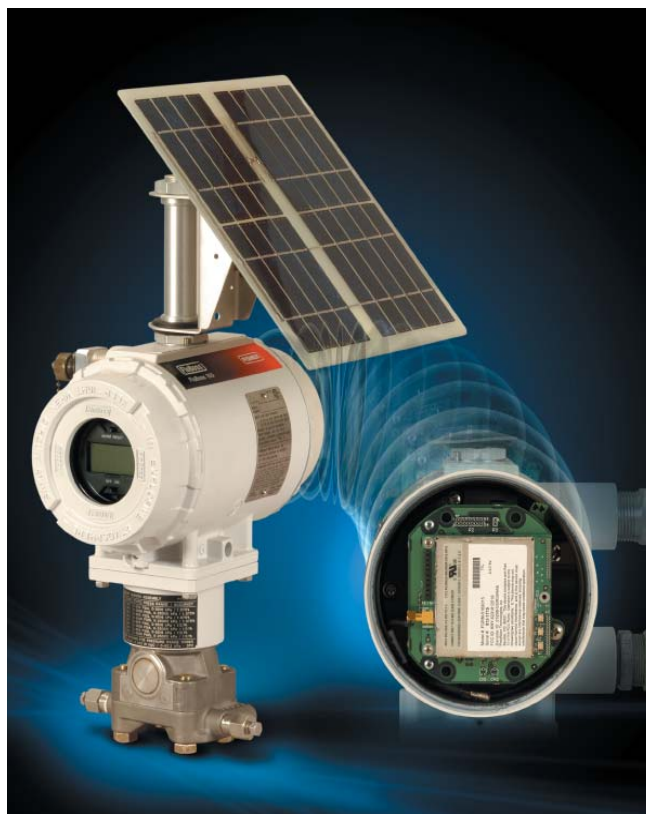
FloBoss 103 shown with optional spread-spectrum radio and 5-Watt solar panel.

D350902X012 / Printed in USA / 5M / 4-07