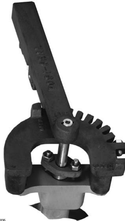
W4896 Lever-Lock Handlever Actuator Mounted on Valve