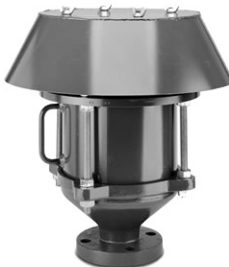
Figure 1. Typical Enardo Free Vent Flame Arrestor