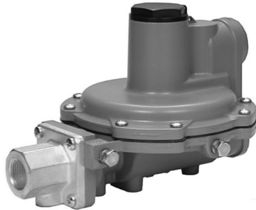
Figure 1. Type R632A Integral Two-Stage Regulator

The Type R632A is an Underwriters Laboratories (UL®) listed regulator designed for Two-Stage LP-Gas systems. The unit is designed to reduce the tank pressure through an integral two-stage system to 11 inches w.c. / 27.4 mbar. The first-stage screened drip-lip vent is oriented downward and the second-stage vent is oriented over the outlet as standard.