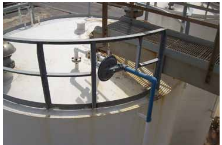
Fisher Type Y693 Tank Blanketing Regulator Installed at a Major U.S.A. Chemical Plant

Major U.S.A. chemical manufacturer gained a net savings of $126k per year in nitrogen costs by sizing and selecting a Fisher regulator for its tanks.