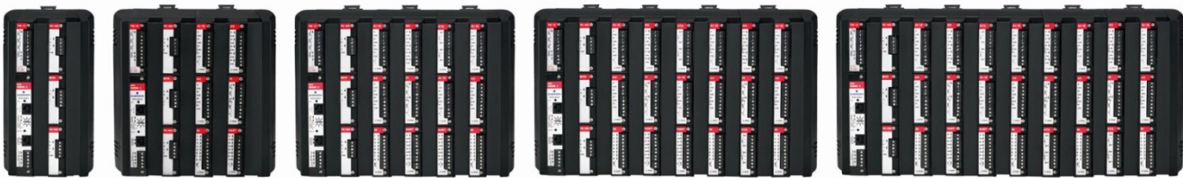
ROC827L (with 0, 1, 2, 3, and 4 expansion I/O backplanes)

The ROC800L economizes its power consumption for normal operation through the use of internal 3.3 volt electronics.