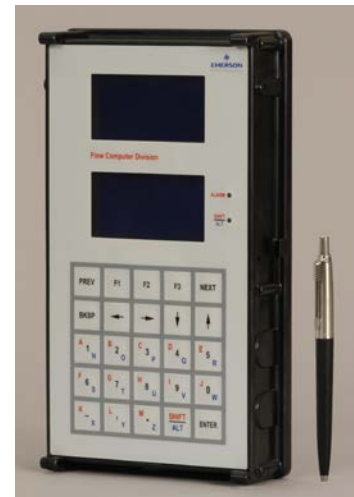
ROC800 Keypad Display

The ROC Keypad Display may be installed with an optional visor for use in high glare applications.