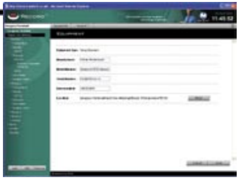
► Equipment Detail