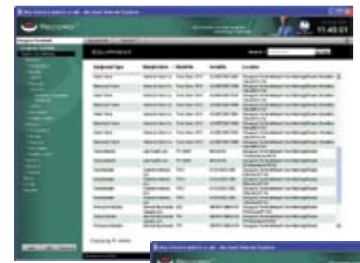
▲ Equipment List