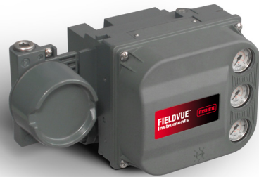
FIELDVUE DVC6200 digital valve controller

To ensure reliability, extensive testing is conducted, including extended cycle, vibration, and performance. Extended cycle testing completed over a thirty month period has resulted in four million cycles with no change in valve performance.