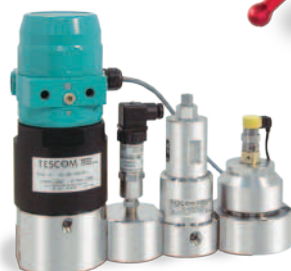
Stackable Pressure Components