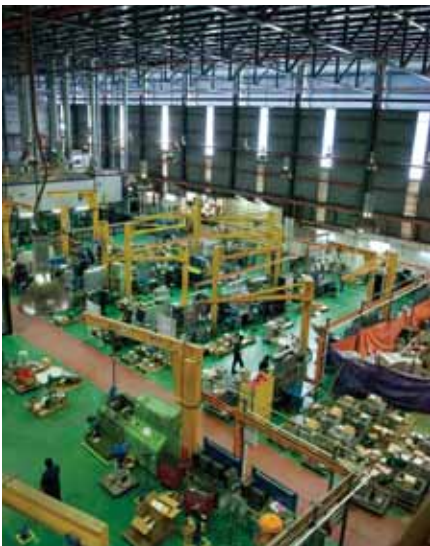
Just a fraction of our 133,000 square feet of manufacturing floor space.

Fisher® control valves is an established brand of Emerson Process Management. Emerson owns and operates world-class valve manufacturing plants around the world, one of which is in Nilai Malaysia. The centre in Nilai manufactures and assembles a wide variety of Fisher products for the Asia Pacific and Middle East markets. Fisher valves are used in various process industries in oil and gas, petrochemical, chemical, pharmaceutical, metals and mining, power, pulp and paper, and several others. With more than 125 years of valve manufacturing experience and a reputable brand name that stands for performance and reliability, customers can expect the best-in-class level of customer satisfaction and quality excellence from the manufacturing centre in Nilai.