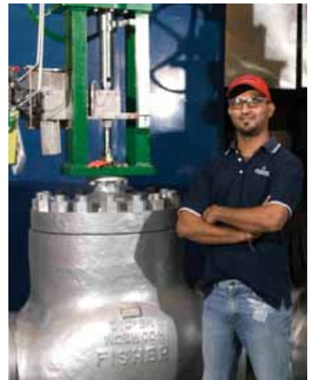
A Nilai staff member is smiling because he has just completed building 10 units of Fisher EWT large valves for one of the world's largest Liquefied Natural Gas plants in the Middle East.