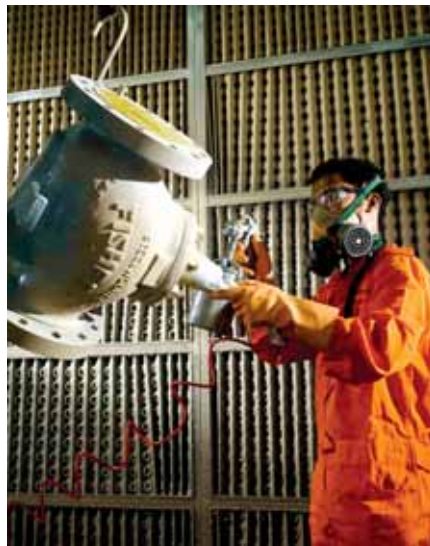
Putting the finishing touches on one of Fisher valves produced at our manufacturing centre in Nilai.