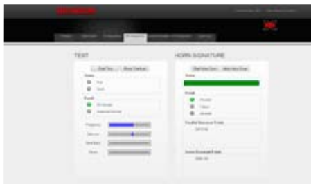
P/S Diagnostics – Analyzes horn frequencies and performance.

Whether on-site or around the world, the DCX BUC service port is a single point of access