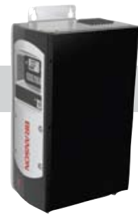
Three compact DCX configurations – horizontal, vertical with side mount or rear plane mount