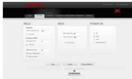
Weld Preset – Sets welder control parameters such as amplitude, starting ramp, and frequency seeking.