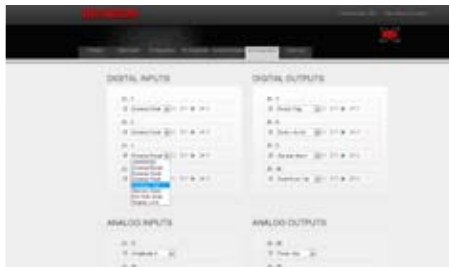
I/O Configuration – Assigns I/O pin numbers to control functions and logic type.