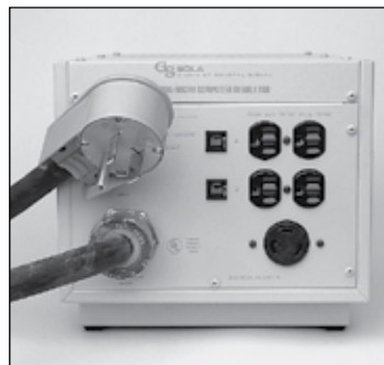
60 Hz, 2000–3000 VA, (4) 5-15R and (1) L5-30R Receptacle