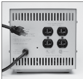
60 Hz, 70 – 1000 VA, (4) 5-15R Receptacles