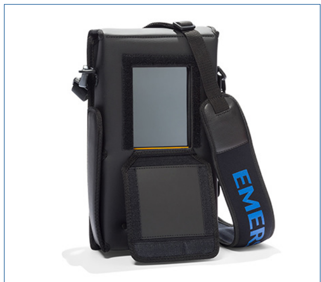
The useful carrying case protects your Trex unit in the field and provides storage options for accessory items.

Using the ValveLink Mobile app on the Trex unit, you can perform valve diagnostics in the field, including valve signature, dynamic error band, PD one button sweep, and step response, without having to pull the valve or perform invasive troubleshooting steps. ValveLink Mobile works with HART and Foundation Fieldbus Fisher® FIELDVUE™ digital valve controllers and provides an intuitive user interface that is easy to understand and use. The large touchscreen on the Trex communicator makes it easier than ever to see all valve diagnostic details.