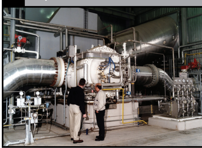
Figure 1. Fouling due to the rapid build up of deposits causes compressor performance to suffer.

ule downtime at the least disruptive time.