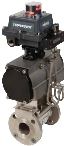
Figure 2: On-off valve controller on valve and actuator.

Since on-off valve controllers make on-off valves intelligent, these intelligent on-off valves can now be integrated with the control system, as well as with asset management software working with control valves, electric actuators / motor operated valves, analyzers, and transmitters. Therefore, on-off valve controllers can be managed centrally from a computer in an office accessing configuration and