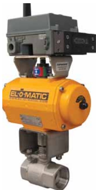
Figure 1: WirelessHART on-off valve controller.

Start modernizing aging plants by installing wireless on-off valve controllers on the most frequently used manual on-off valves. Reducing the need for operators to go to the field to open and close valves improves plant