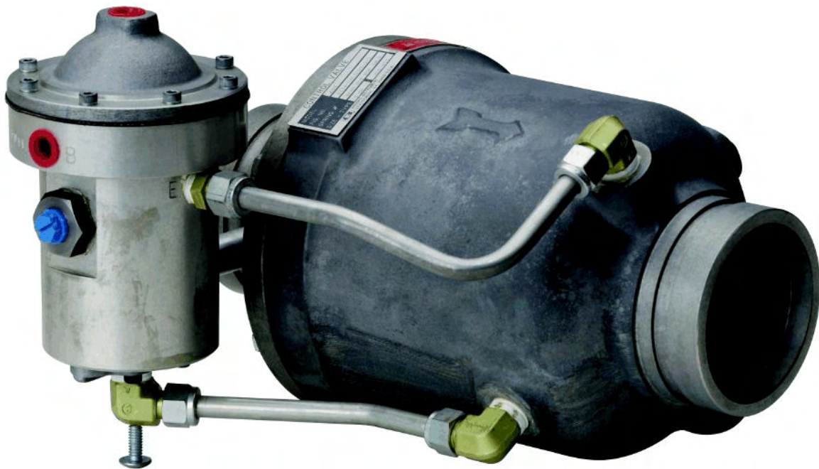
Figure 1-1. Daniel Control Valve Series 600

Should you need additional information concerning the Daniel Control Valve, please feel free to contact your local Daniel Division Sales Office, Representative, or our Houston facility. We are pleased to have this opportunity of serving you for your measurement and control needs.