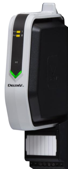
S-series AS-i Interface Card

In DeltaV v12 and later, signals referenced for each connected AS-i device will count at most 1 DST. The DST type counted will be the most valuable type used to reference a signal for each device. For example, a device with 1 DI signal reference and 1 DO signal reference will count as 1 DO DST. For DeltaV versions prior to v12, each signal referenced from a connected AS-I device will count as 1 DST each.