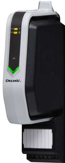
S-series H1 Fieldbus I/O Interface Card.

The Fieldbus I/O Card meets ISA G3 corrosion specifications by using superior electronic components and conformal coating.