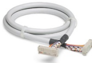
Terminal Assembly Base