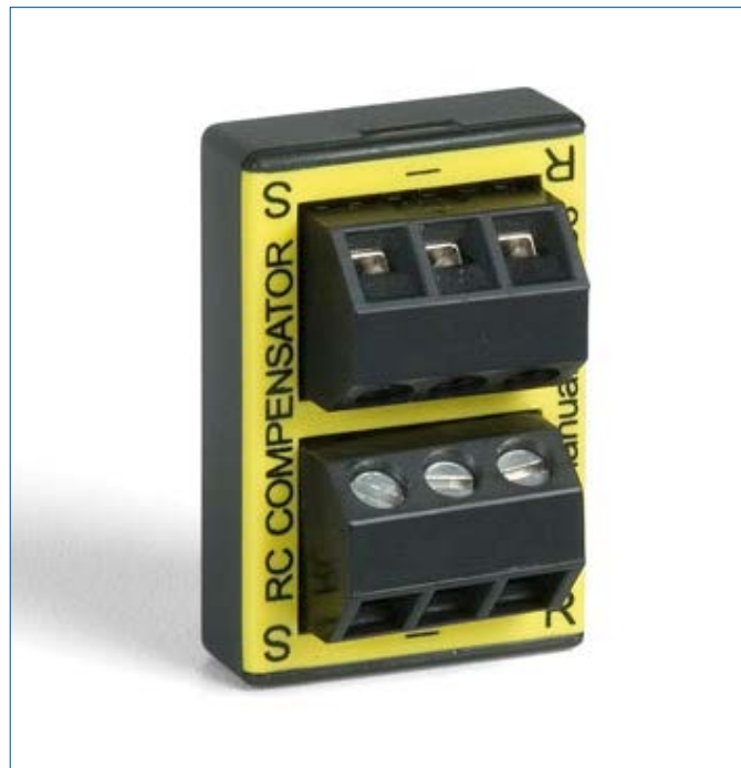
RC Compensator Module.