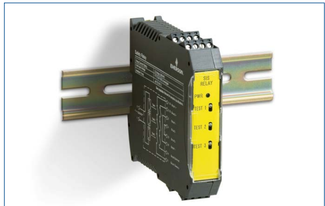
SIS Relay Module.

A relay coil is energized for all three relays in normal operation. If a demand occurs, the SLS removes the power from the coil for all three relays at the same time. Each relay can be proof-tested in the field.