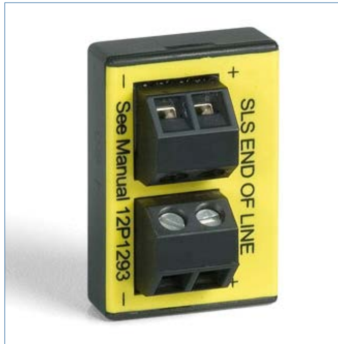
End of Line Resistance Module.