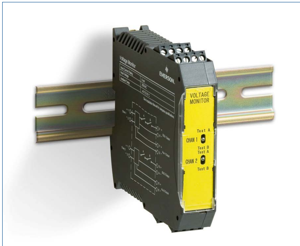
SIS Voltage Monitor.