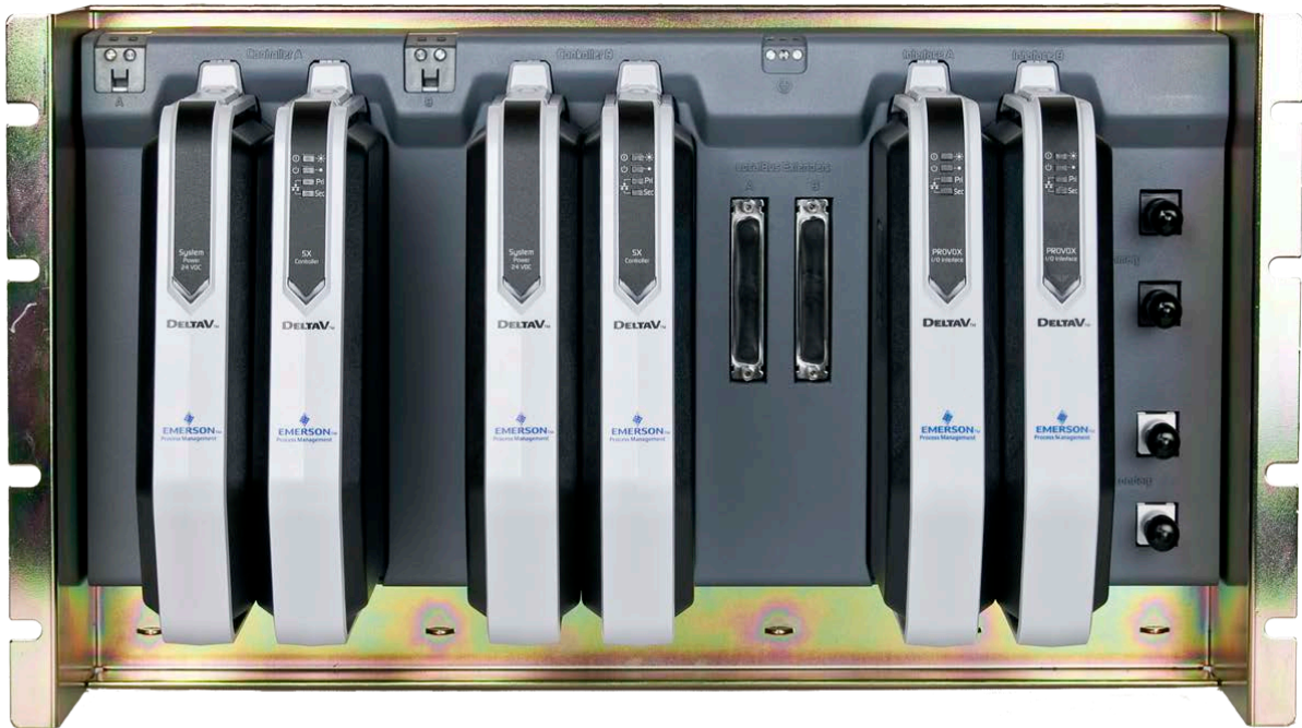
The S-Series DeltaV Controller Interface for PROVOX I/O.