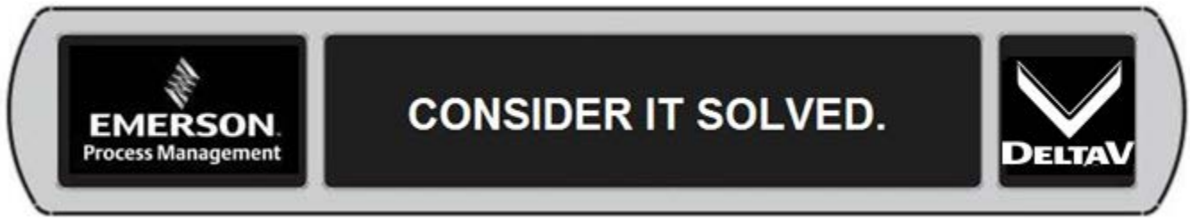
Nameplate holder and insert provide standardized labelling for DeltaV equipment cabinets.