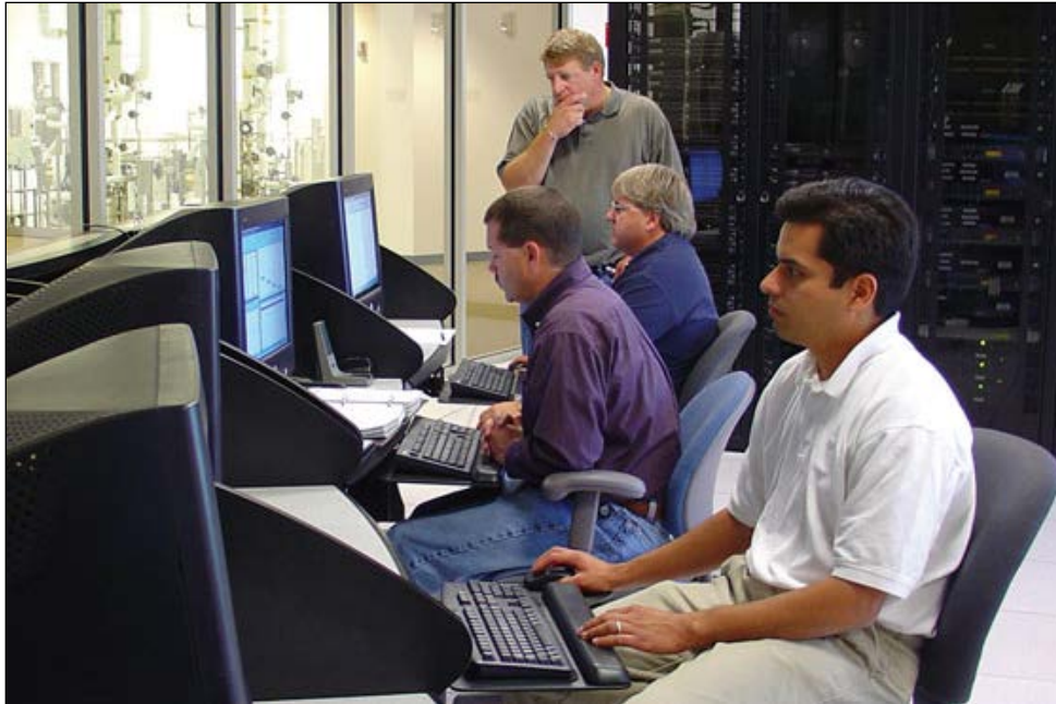
You can easily engineer your process automation system using the Engineering Seat software