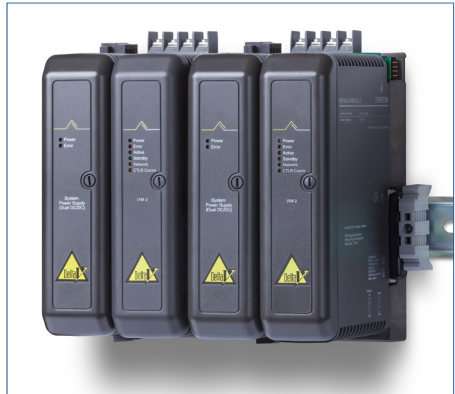
The M-series Virtual I/O Module 2 provides DeltaV™ I/O simulation and a high speed Ethernet I/O device integration platform.