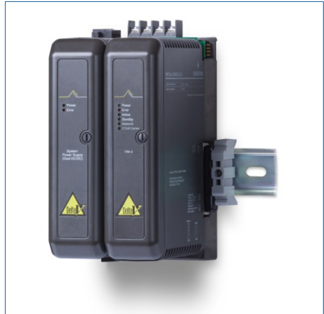
M-series system power supply and VIM2.

Modular, flexible packaging. The VIM2 mounts in the same manner as the DeltaV controller. It mounts in the controller slot of a DeltaV 2-wide horizontal or 4-wide vertical carrier and uses a standard DeltaV System Power Supply. The advanced design of the VIM2 will provide years of uninterrupted use.