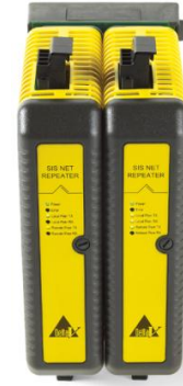
A redundant pair of SISnet Repeaters

Carrier Extender CTbles extend LocalBus power and signals between 8-wide carriers. Local peer bus extender cables extend the local peer bus (SISnet) between Logic Solvers on different carriers. 1-wide carriers with terminators terminate the local peer bus at the final carrier.