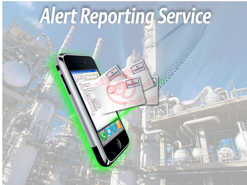
Plant Messenger delivers DeltaV™ alarms and events anywhere in the world.