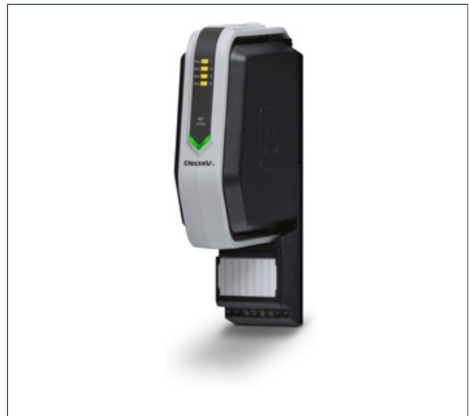
S-series 4-port H1 Fieldbus I/O Interface Card.