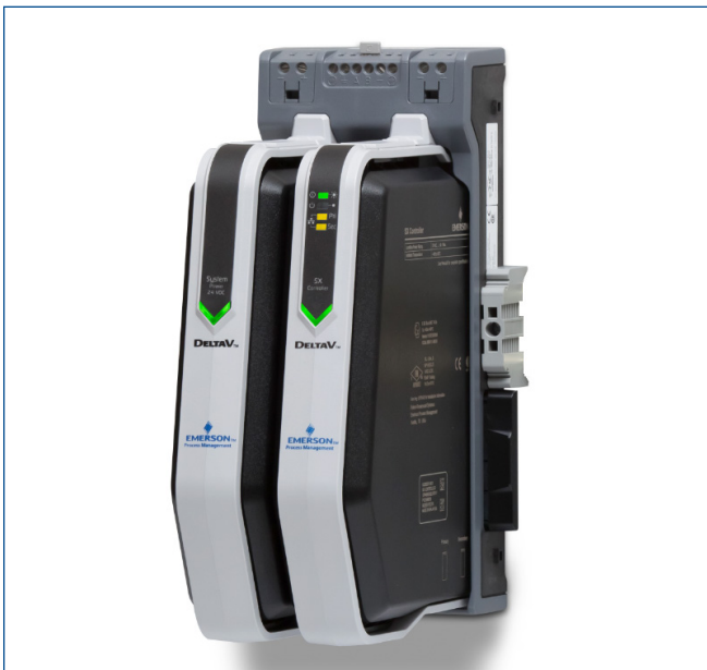
The SX Controller.

Field Proven Architecture. The S-series controllers are an evolution of DeltaV M-series hardware. The new design delivers installation and robustness enhancement while still using the same processor and OS that has proven itself in the field. All IO cards run the latest software enhancements of corresponding M-series IO cards and deliver the same field proven, reliable operation.