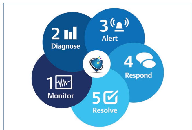
The DeltaV System Health Monitoring Service process.

When a health condition is detected, the local System Health Monitoring appliance alerts Emerson. The alert is diagnosed and analyzed to identify the most likely root causes. Recommended actions are then provided to you and the local service provider to enable a collaborative and quick resolution of the issue. The statuses of the alerts are tracked in Emerson’s Call Tracking System and the Guardian Web Portal to ensure that problems are ultimately resolved.