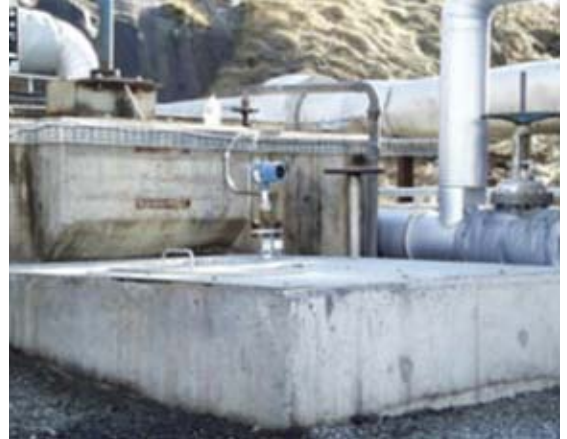
The Rosemount 3300 reliably measures level and interface in pump sump pits.

http://www.emersonprocess.com/rosemount/products/level/m3300.html