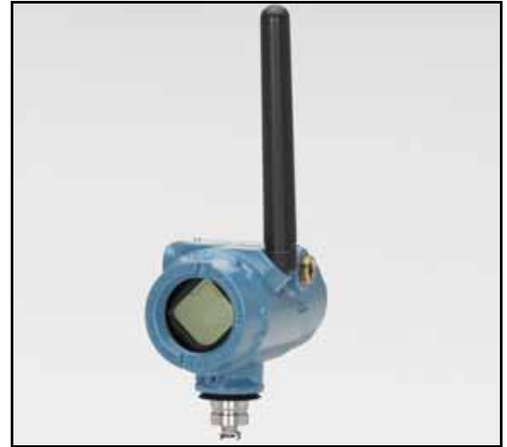
Rosemount 648 Wireless Temperature Transmitter

Rosemount and the Rosemount logotype are registered trademarks of Rosemount Inc. All other marks are the property of their respective owners.