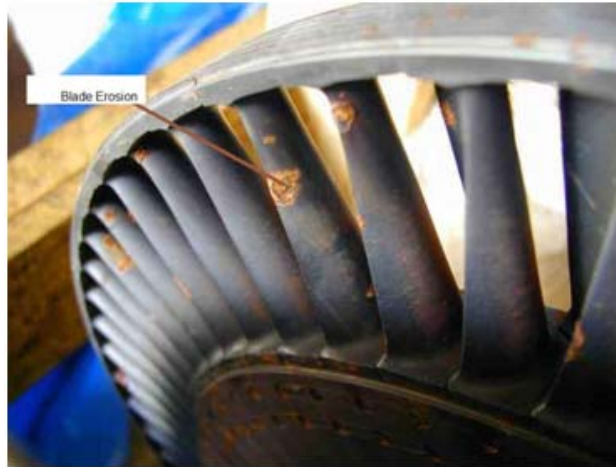
Figure 1. Water Impingement on Turbine Blades