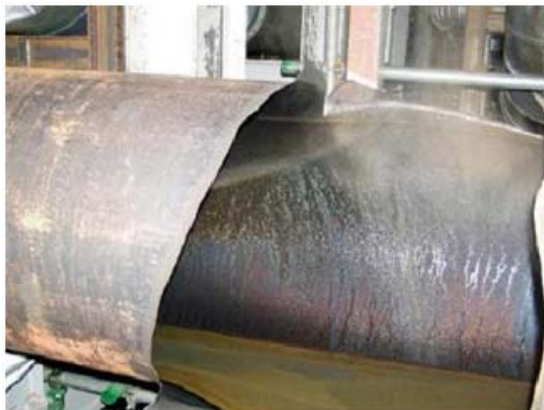
Figure 2. Steam Line Rupture Caused Four Deaths