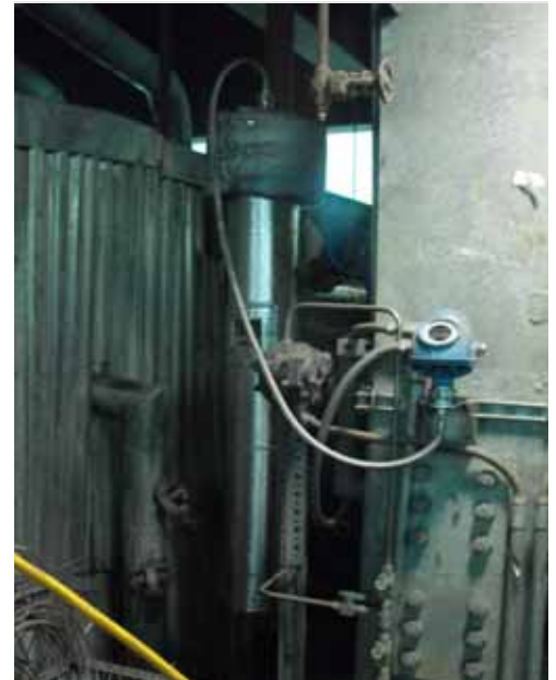
Figure 1: Rosemount 5301 with Dynamic Vapor Compensation measures reliably on boiler drum

They experienced many negative business results due to inadequate drum level control during routine start-ups. Unreliable drum levels risked high operations and maintenance costs to replace damaged water tubes and risked carryover into turbines. Unstable level measurements reduced efficiency of the boiler and increased utility costs. Lastly, unplanned process shutdowns directly translated to lost production.