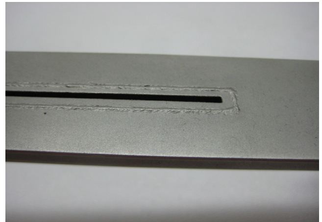
Figure 2. Smooth front of 485 Annubar

As flow rates increase and the fluid directly adjacent to the Annubar surface (the boundary layer) transitions from laminar to turbulent, the separation point with a smooth sensor surface will change, causing a shift in the flow coefficient. For high Reynolds Number applications (exceeding 1 million), a textured surface finish is applied to the front surface of the Rosemount 485 Annubar. Roughening the 485 Annubar's surface forces the flow in the boundary layer to remain turbulent throughout the operating range and keeps the separation point constant. Figure 3 shows the roughened front surface of the 485 Annubar. Liquid applications are generally low Reynolds Numbers and gas and steam are generally high Reynolds Numbers.