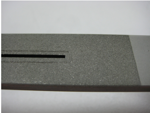
Figure 3. Roughened front surface of 485 Annubar