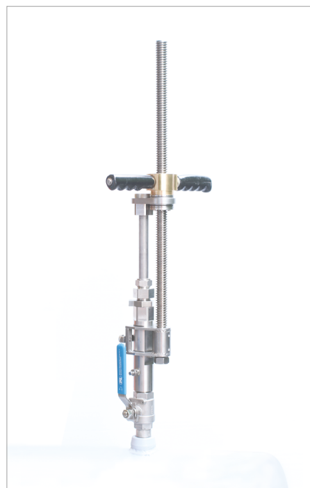
Retractor Tool connected to Retractable Probe Assembly.