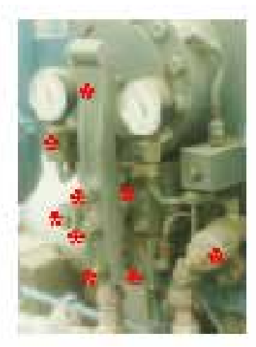
*Lubrication or adjustment points.

Heavily corroded or misadjusted poppet controls will not provide reliable operation and can cause expulsion of oil from the gas/hydraulic tanks on the Rotary Vane. The standard poppet block improvements are :