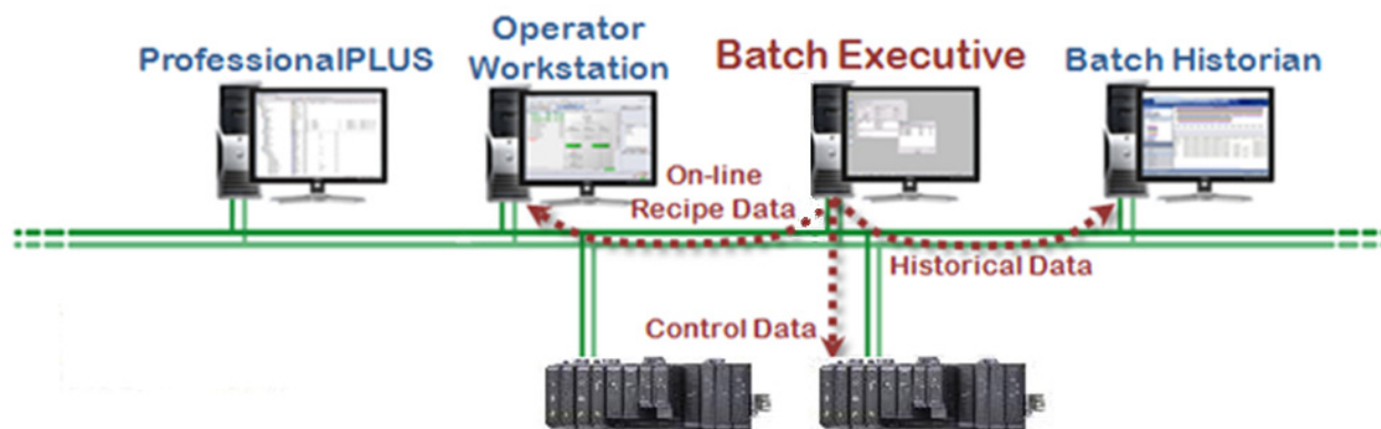
The Batch Executive processes and serves data to the DeltaV Batch application suite.

Batch Information on DeltaV Operate Graphics. Users have the option of displaying batch information with other process information on DeltaV Operate graphics. Users can view active batches and their states as well as create new batches and give operational commands or perform an active step change to existing batches. Users can also acknowledge batch prompts and submit comments related to batches from DeltaV Operate.