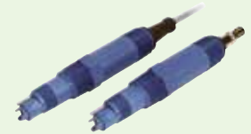
3900 and 3900VP

Enhanced performance and increased life with minimal glass cracking provided by field proven AccuGlass pH glass formulation. Extended sensor life provided by double junction reference. New 3/4 and 1" mounting threads meet a variety of application installation requirements.