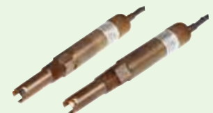
ISE (Ion selective electrode)

The Clarity II turbidimeter is intended for the determination of turbidity in water. Low stray light, high stability, efficient bubble rejection, and a display resolution of 0.001 NTU make Clarity II ideal for monitoring the turbidity of filtered drinking water.