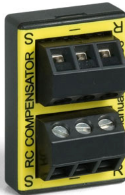
RC Compensator Module