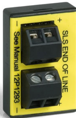
End of Line Resistance Module