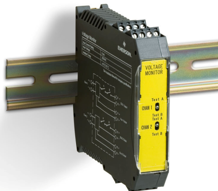
SIS Voltage Monitor