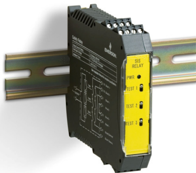
SIS Relay Module