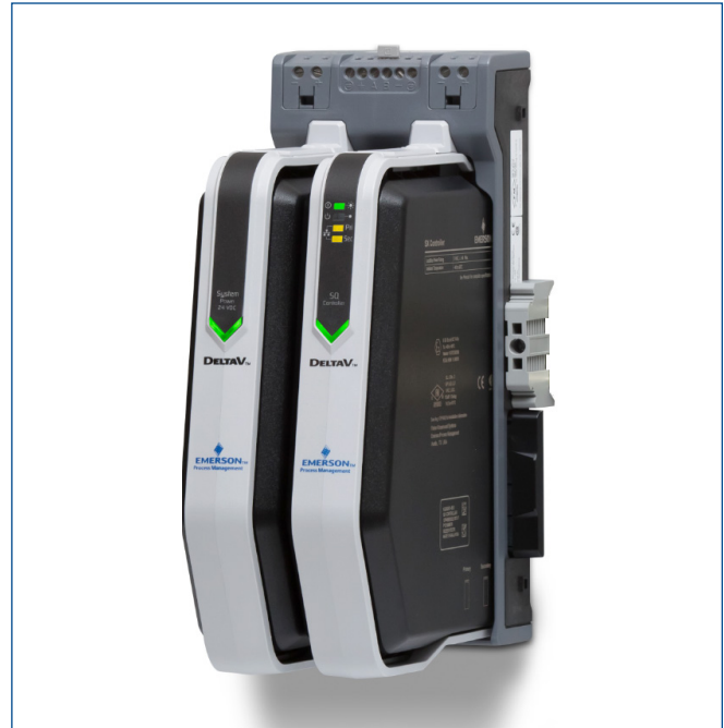
The SQ controller.

Designed for Electronic Marshalling. The SQ controller have highly distributable I/O capabilities with CHARMs based Electronic Marshalling. Electronic Marshalling I/O can be mounted anywhere, facilitating system design and expansion while reducing overall system footprint over traditional marshalled I/O Subsystems.