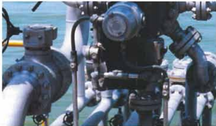
Fig. 3: Actual MPFS in an offshore field.

communication protocols. The actuator's display shows which well is under test at any given time. Built-in diagnostics also make sure that issues like control error, motor overload, and power loss are resolved immediately. MPFS provides an additional advantage in sour oil and gas fields. When high nickel-chromium internal cladding is required, the simplified piping and fewer valves results in much lower cladding cost.