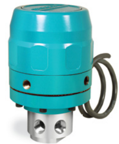
ER3110 (WITH 44-5200 SERIES REGULATOR)

TESCOM ER3100 Series consists of the ER3000 Series controller and a 44-4000 Series pressure reducing regulator integrated together. Inlet pressures are up to 4500 psig / 310 bar with two different outlet ranges of 400 and 900 psig / 27.6 and 62.1 bar. The ER3100 Series may be ordered with a C_v = 0.7 or a C_v = 2.0 . This series offers fast accurate control in applications requiring continuous flow. Also available with the 44-5200 Series regulator (ER3110).