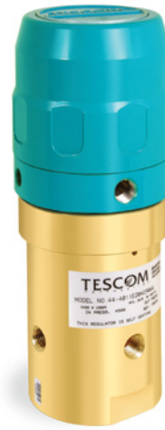
ER3100 (WITH 44-4000 SERIES REGULATOR)