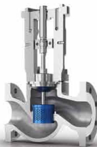
GX Control Valve with Whisper Trim ® III Cage