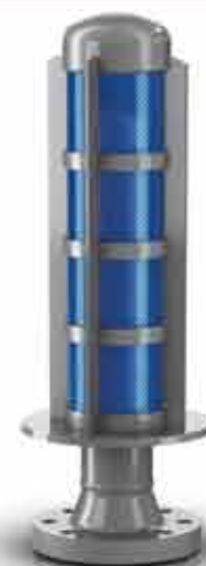
6012 Vent Diffuser