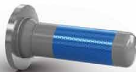
6011 Inline Diffuser