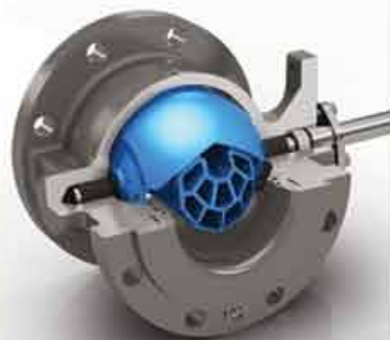
Vee-Ball ® Control Valve with Rotary Attenuator