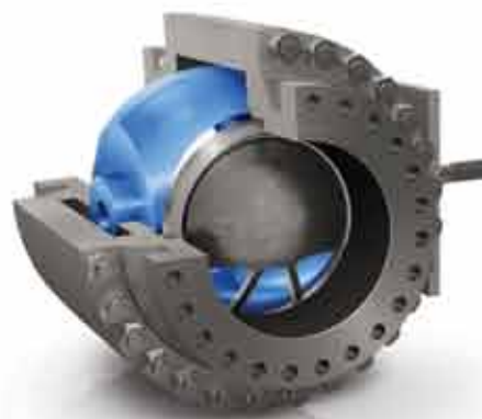
V260A Control Valve with Aerodome Attenuator