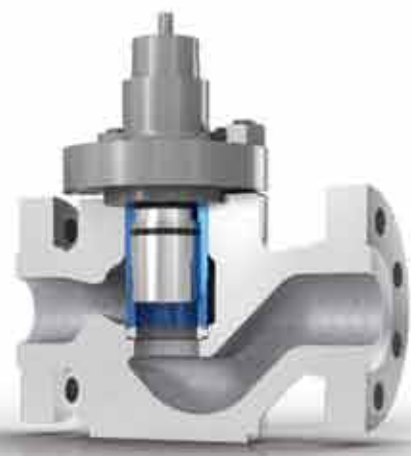
Whisper Trim ® III Cage