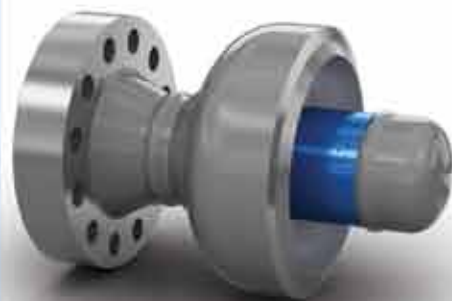
6010 Inline Diffuser