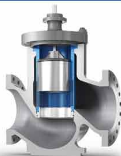
WhisperFlo ® Cage