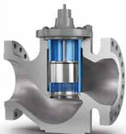
Whisper Trim ® I Cage