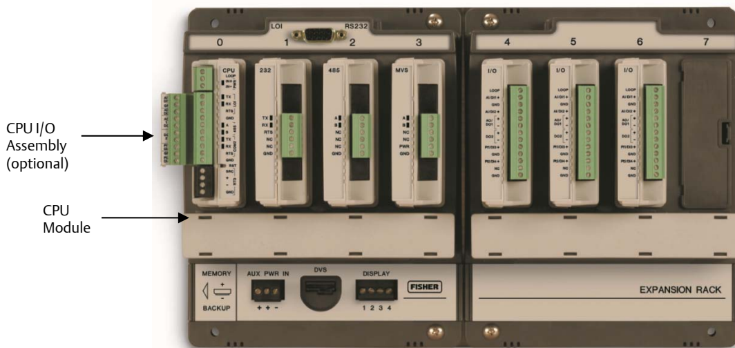
FloBoss 107 with optional Expansion Rack