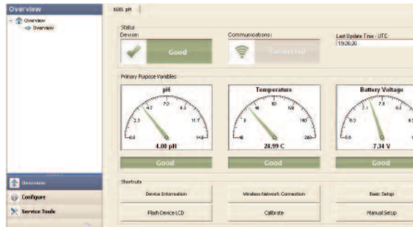
Advanced diagnostics support live troubleshooting