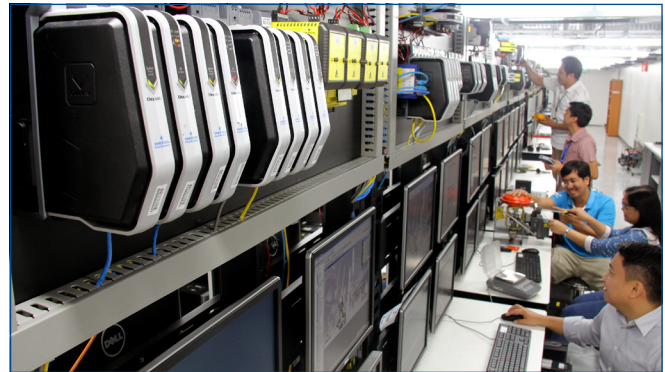
The Global Service Center provides immediate access to technical support on a 24x7x365 basis.