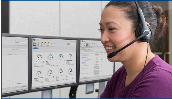
The Global Service Center provides immediate access to technical support on a 24x7x365 basis.