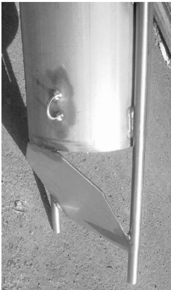
Figure 1. Bottom pipe with Wire ring and Bottom pipe legs