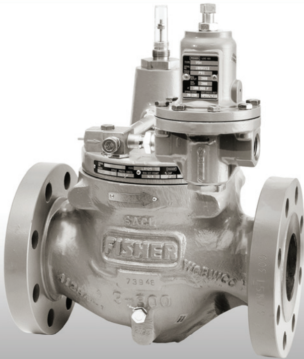
TYPE LR125 PRESSURE REDUCING LIQUID REGULATOR

Accurate, reliable liquid pressure control