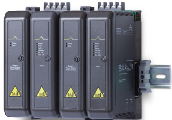
M-series VIM2 and power supply

Modular, flexible packaging. The VIM2 mounts in the same manner as the DeltaV controller. It mounts in the controller slot of a DeltaV 2-wide horizontal or 4-wide vertical carrier and uses a standard DeltaV Power Supply. The advanced design of the VIM2 will provide years of uninterrupted use.